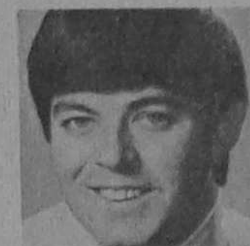
TONY BLACKBURN spins your favourites at 5 p.m.